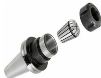
ISO 30/40 Holder