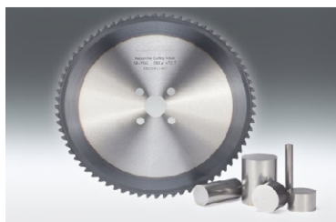
TCT Carbide Cutter