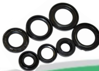
Hydraulic Oil Seal