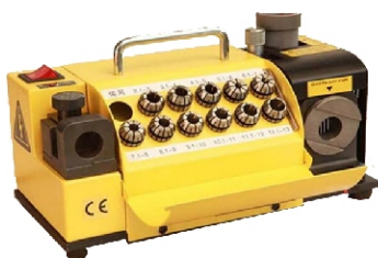
Drill Bit Re-Sharpening