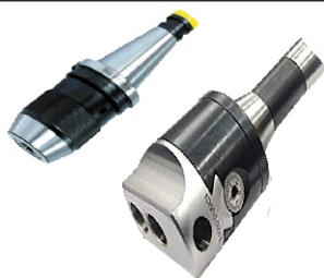
Drill Chuck & Boring Head