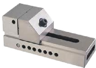
Precision Surface Grinding Vices