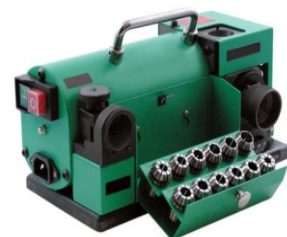
End Mill Re-Sharpening